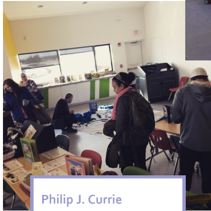
Philip J. Currie Dinosaur Museum